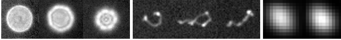
Figure 2: Examples of blurs: (left) three blurs caused by out-of-focus lens with 7-blade diaphragm and different focal length and aperture size; (middle) three blurs caused by camera motion during exposure; (right) two blurs caused by atmospheric turbulence.